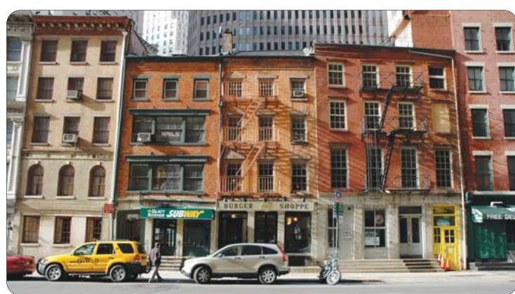
A very Hopper-esque group of post-Civil War buildings along Water Street, long a main thoroughfare of Lower Manhattan.