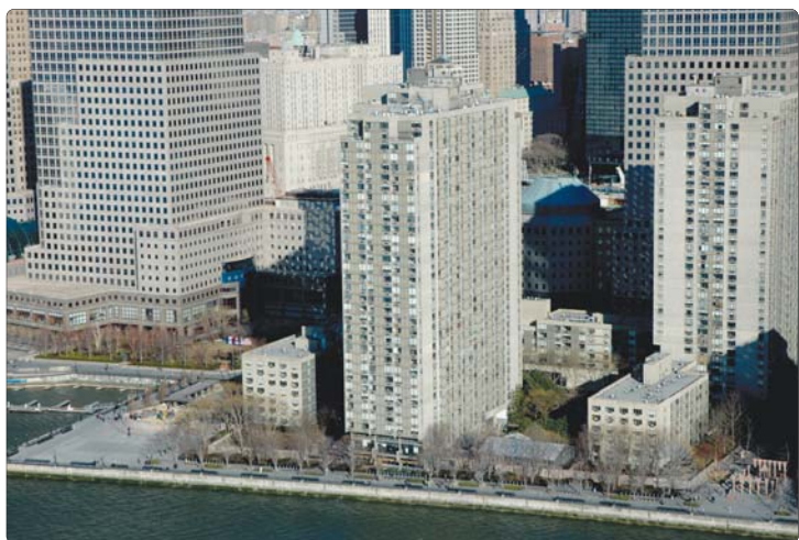
Gateway Plaza Battery Park City's first residential complex, with some 1,750 apartments, has long been a bastion of affordability—at least by Manhattan standards.

As housing prices in Manhattan inch upward, can and will Battery Park City remain the middle-class enclave it was designed to be? Much of the answer to that question rests on the fate of Gateway Plaza, Battery Park City's largest housing complex, where rent stabilization is due to expire in 2009.