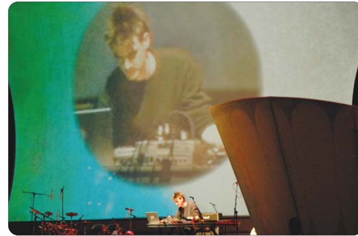
Snakes and Ladders, a performance of new works by contemporary Irish composers includes work played on new-age bagpipes and laptop computers

Snakes and Ladders, a gathering of musicians performing new works by contemporary Irish composers, echoed throughout the Winter Garden on the evening of March 16 and at lunchtime on St. Patrick's Day, March 17. The festival of Irish music—which ranged from new-age bagpipes to electronic sounds played through laptop computers—concluded with the world pre-