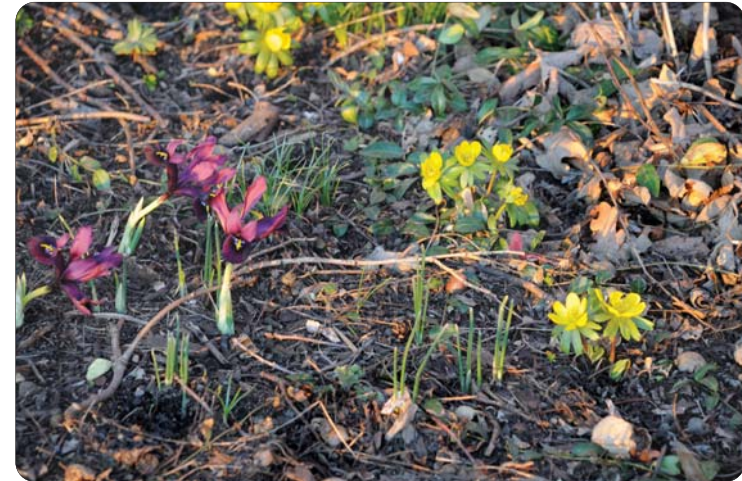
Miniature irises and winter aconite.